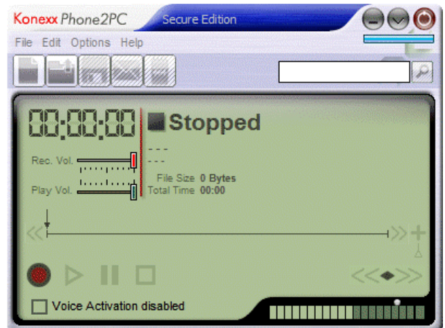
USB Phone 2 PC – Secure Software