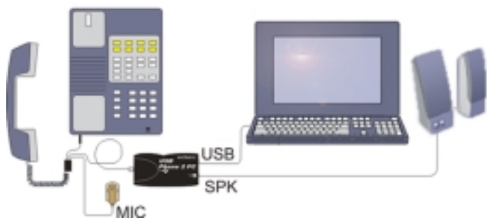
Phone 2 PC Interface