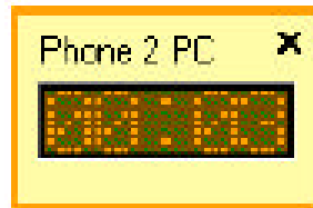
Counter for Convenient Position Reference