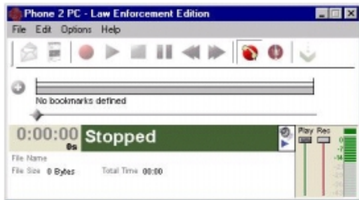
Phone 2 PC – Law Enforcement Software