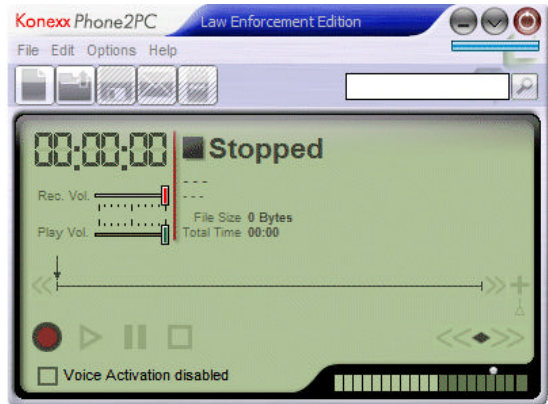
Phone 2 PC – Law Enforcement Software