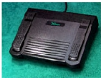
3 Key Foot Pedal