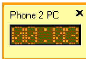
Counter for Convenient Position Reference