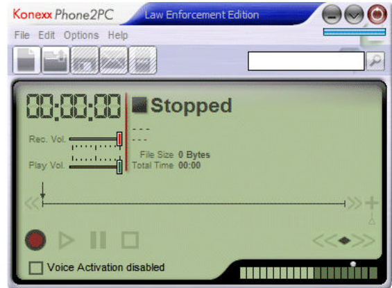
Phone 2 PC – Law Enforcement Software